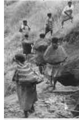
Villagers returning home