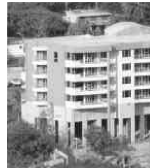
Port Moresby housing