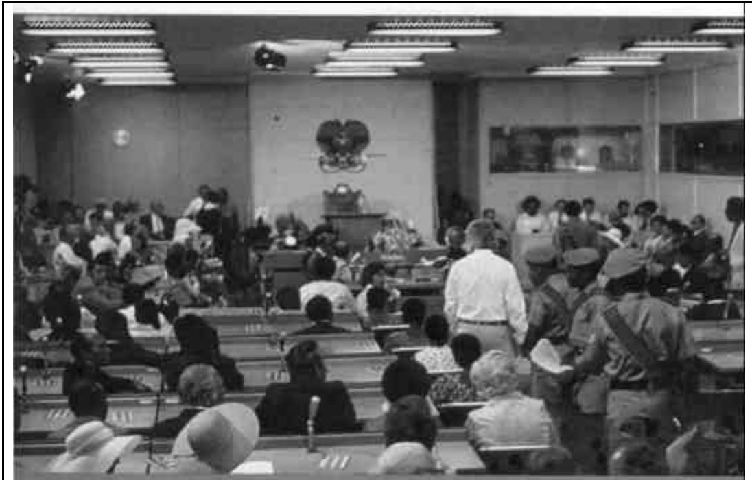
First sitting of parliament

Self-government meant the transfer from Australia to an elected Papua New Guinean government of all powers except those concerning foreign affairs, defence and the legal system which were to be handed over when Papua New Guinea achieved complete independence.